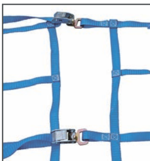
Hatch in the centre of the net for quick and easy loading and unloading